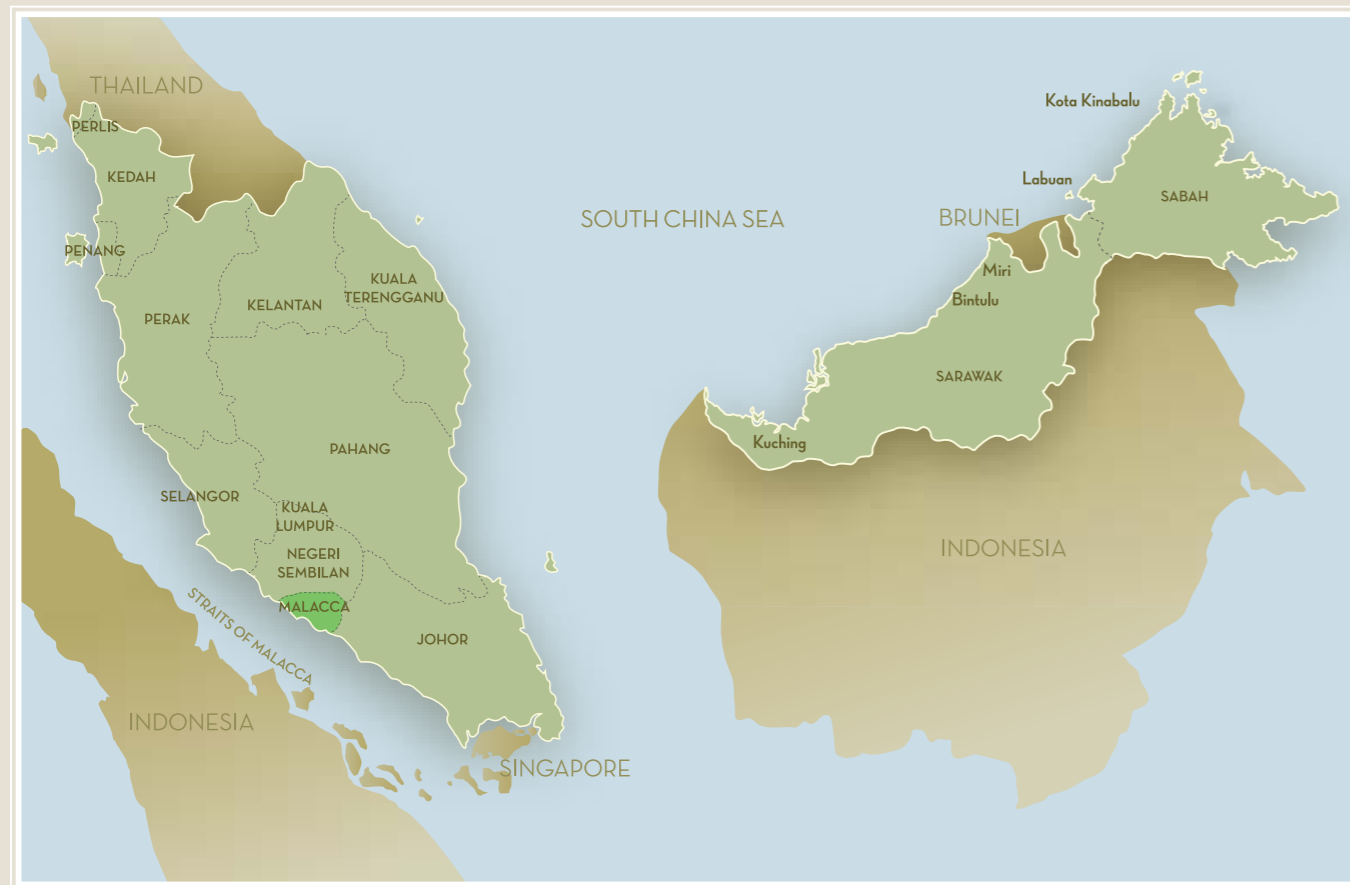
THE MAP OF MALAYSIA

Over the centuries many have come to claim this exotic city, yet it is the city who has ultimately conquered them. Today, every street and every building is testament to centuries of life well lived.