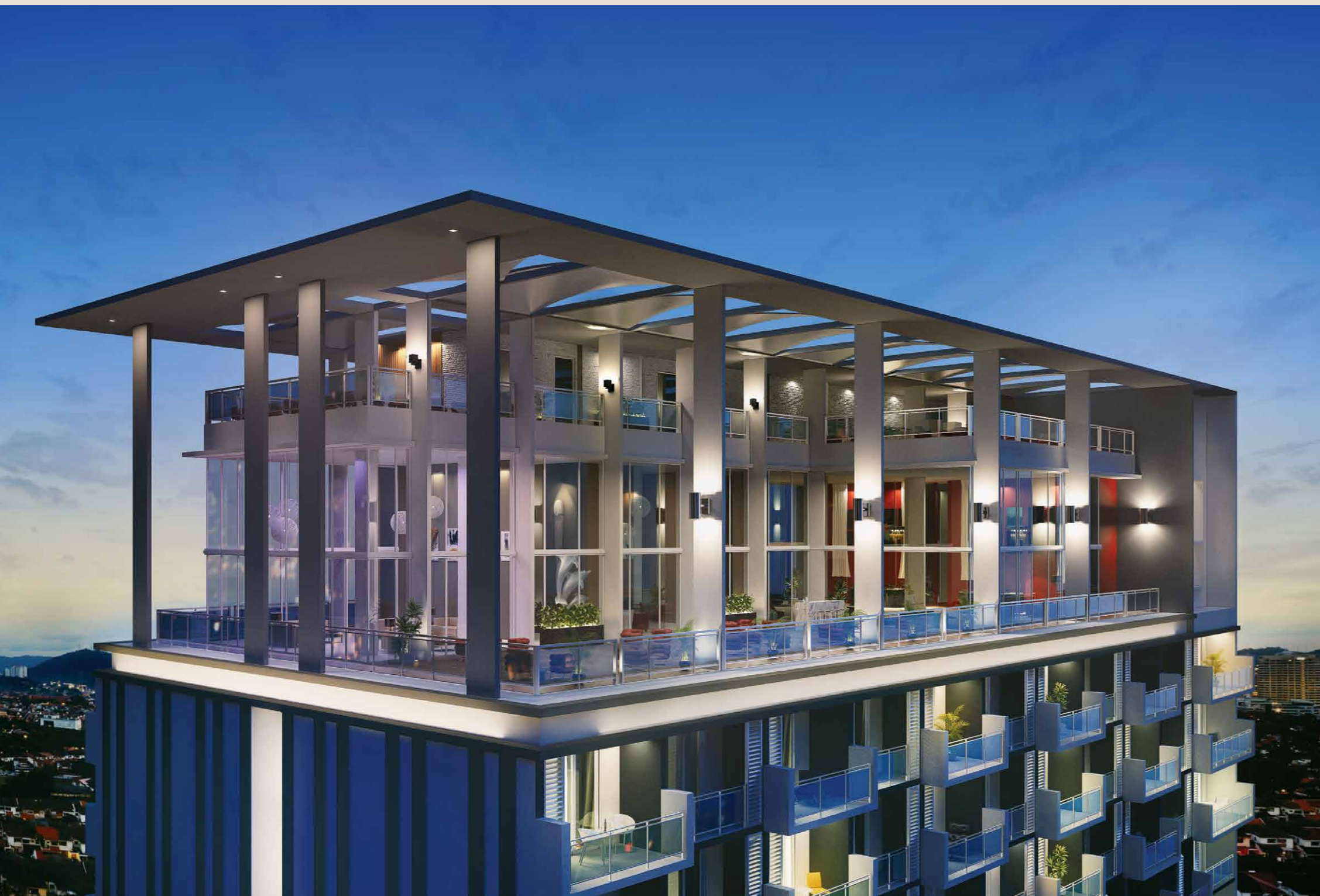
Artist impression of Sky Lounge