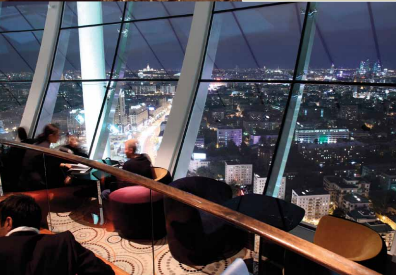
Artist impression of Hotel Tower

The architectural concept behind the entire development is a contemporary interpretation of rich Malaccan heritage, with a distinct nod to Peranakan influences. The open courtyards and ventilated fins of traditional Peranakan houses forming a distinct influence in the architect's vision of "free mobility". And throughout the development, Herman Salih's interpretation of Nyonya heritage through modern art reaffirms the relevance of Malacca in modern day living.