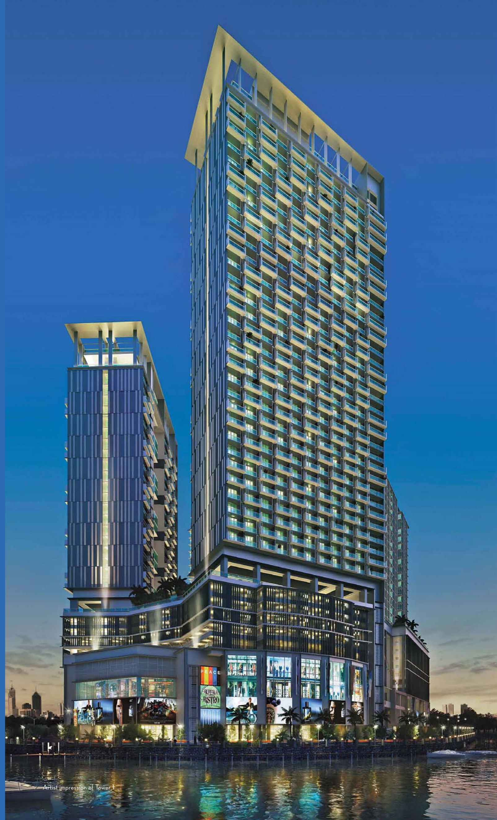
Artist impression of Tower 1

Here, the descendants of the Dutch, Portuguese and British have built homes and made their lives amongst the Javanese and Malays, Chinese and Indians... to create a delightful melting pot and an unforgettable location. From windmills to cathedrals, clock towers to exotic cuisine, Malacca today is a city of contrast and refinement. A city bestowed with UNESCO World Heritage status that you can now be a part of. At The Shore.