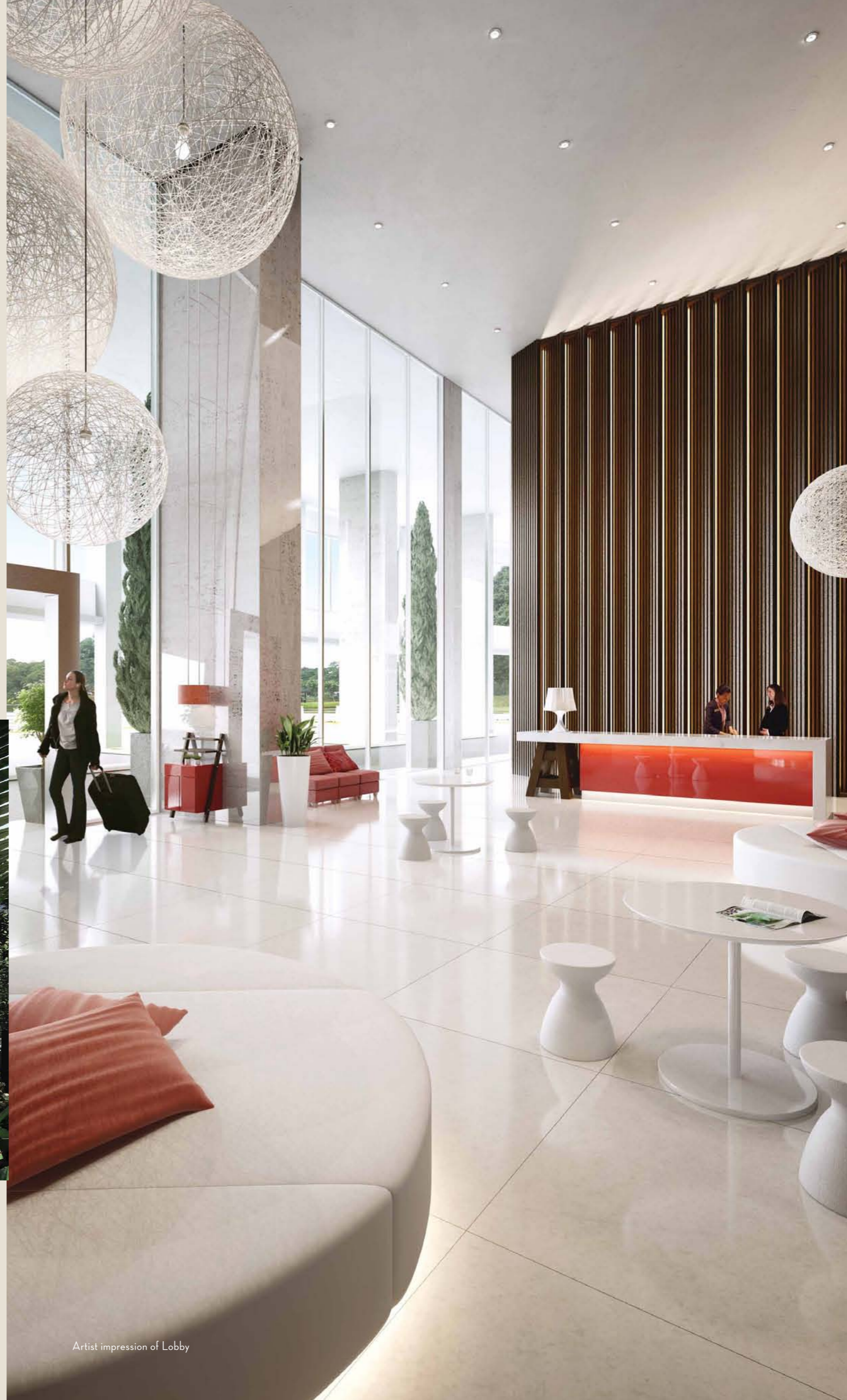
Artist impression of Lobby